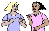
Talk to someone

Most problems can be resolved quickly if students speak with someone who knows how to help. You do NOT have to give your name.