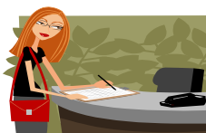
Fill in a complaints form

If the matter cannot be resolved by talking to someone a Complaints & Appeals form should be filled in and given to the Student Services Officer. There are no associated fees for this.